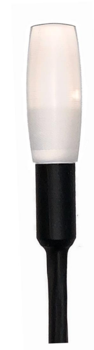
Swaying Reed, Steel rod